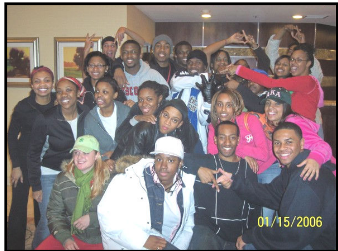
Thirty UW-Madison Impact students went to the MLK conference